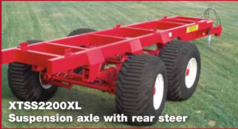
XTSS2200XL Suspension axle with rear steer