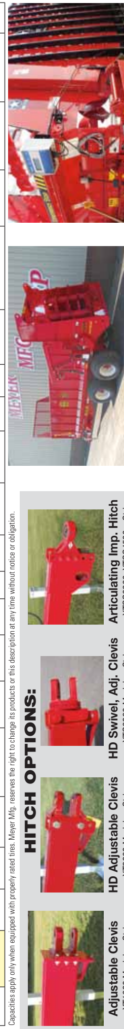
Meyer Crop Max Spreader with Suspension Style Trailer

Scale Packages Available in combination with most trailer and wagon arrangements. Meyer Mfg. Corp. Dorchester, Wisconsin 54425 Phone: 715/654-5132 • FAX: 715/654-5513 • 1-800-325-9103 email: sales@meyermfg.com • home page: www.meyermfg.com American Made • American Owned